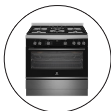
STAINLESS STEEL ELECTROLUX 900MM FREESTANDING OVEN