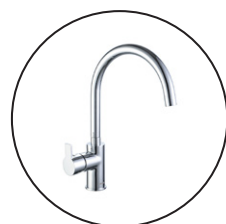
ALDER MIXER TAPWARE