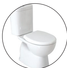
SEIMA TOILET SUITE