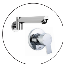
ALDER BATHROOM FITTINGS