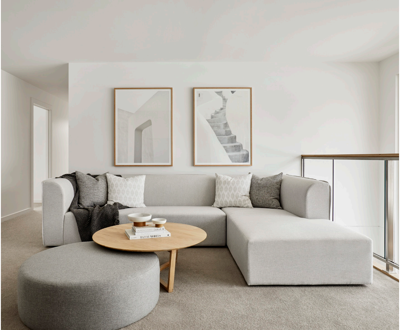
Carpet in a selection of colours to remaining areas of the home (Category 1)