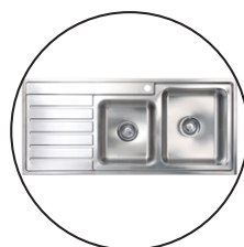
SEIMA STAINLESS STEEL KITCHEN SINK