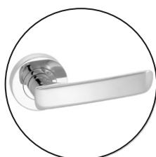
CHOICE OF LEVER DOOR FURNITURE

Solar Panel Hot Water System with gas booster