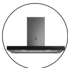
STAINLESS STEEL ELECTROLUX 900MM CANOPY RANGEHOOD

Reconstituted Stone Benchtop with 40mm edge to Kitchen (Category 1)