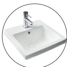
SEIMA VITREOUS CHINA VANITY