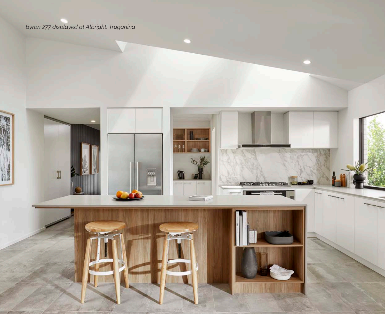
Byron 277 displayed at Albright, Truganina

Visit our award-winning homes at our selected Display Centres >>>