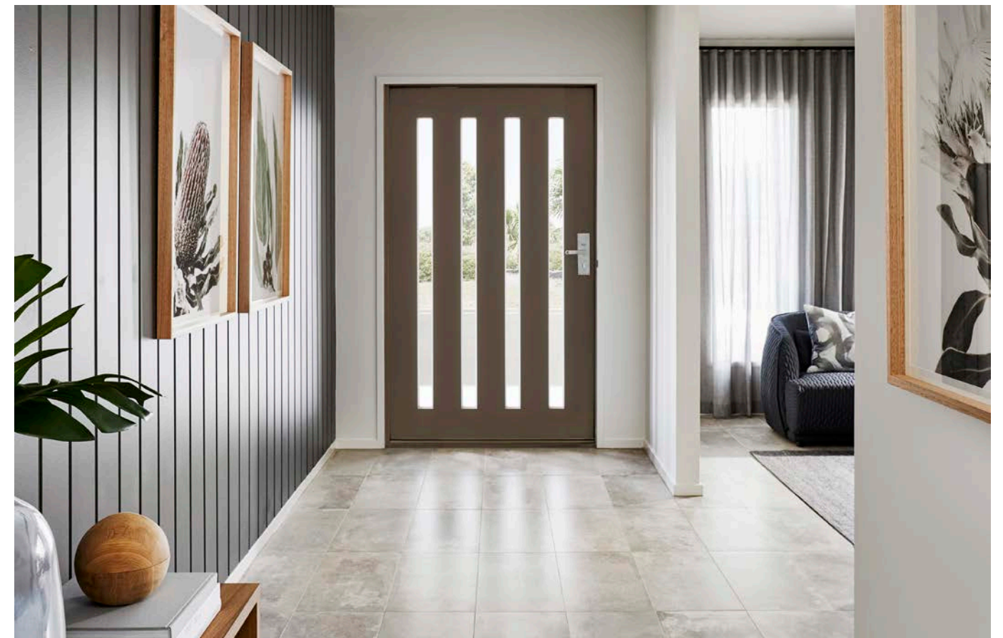
Category 1 tiled flooring to all wet areas, Kitchen, Pantry & Entry Foyer*

The use of Fairhaven Slab Solution is subject to geological analysis.