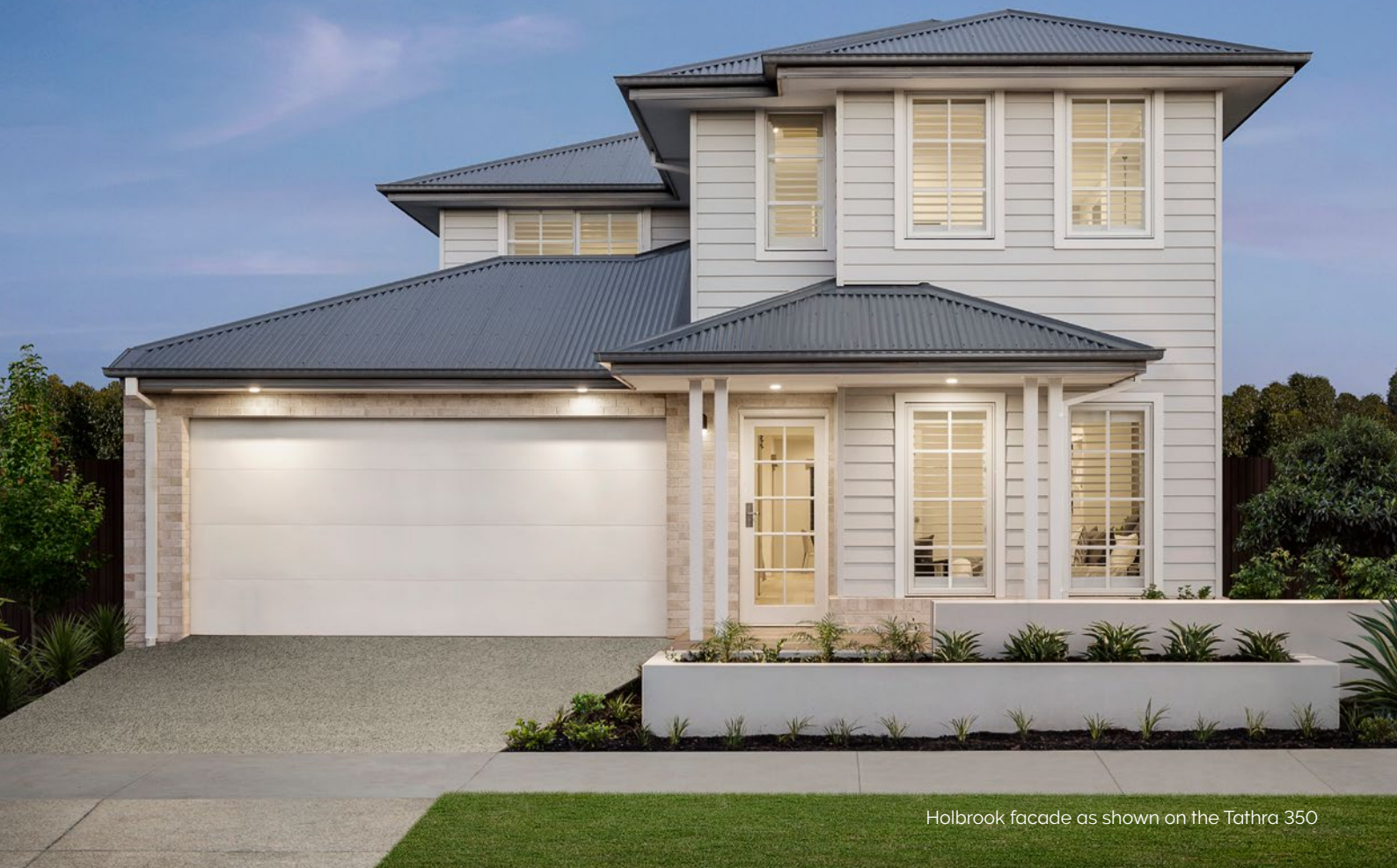
Holbrook facade as shown on the Tathra 350