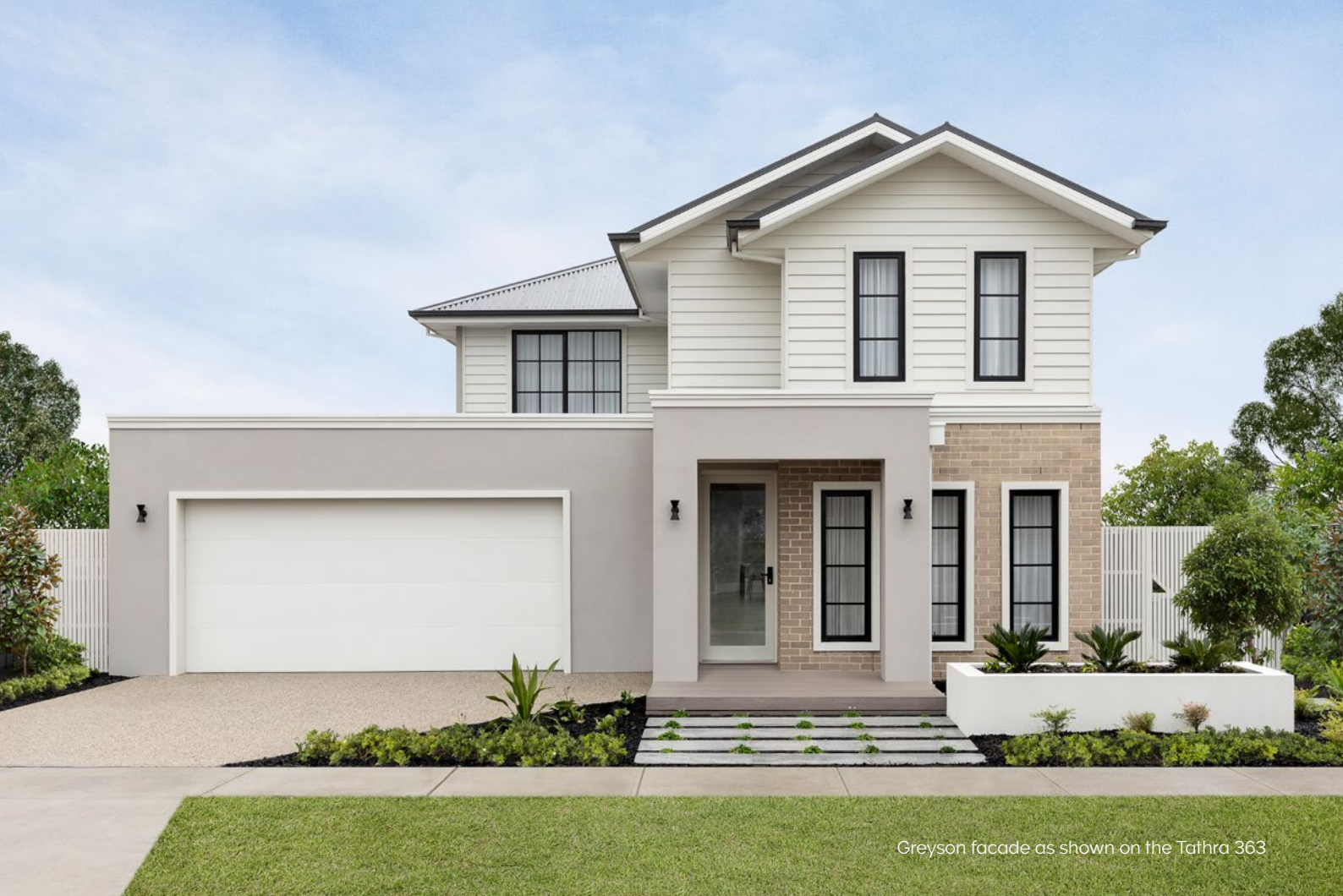
Greyson facade as shown on the Tathra 363