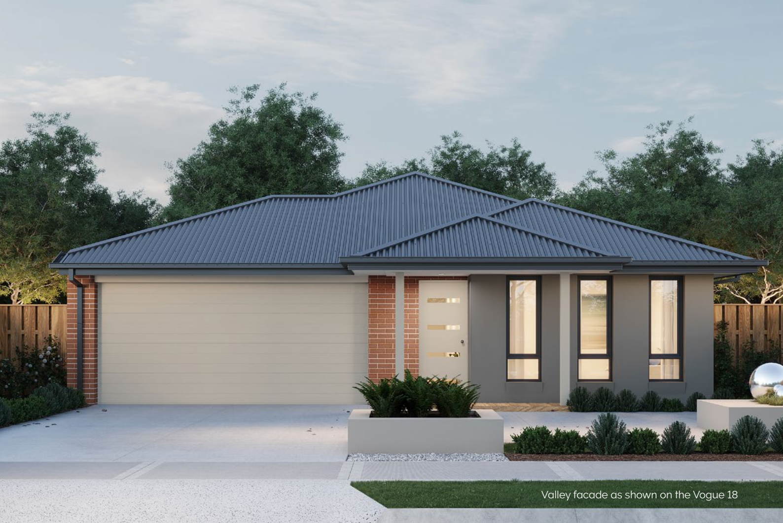
Valley facade as shown on the Vogue 18