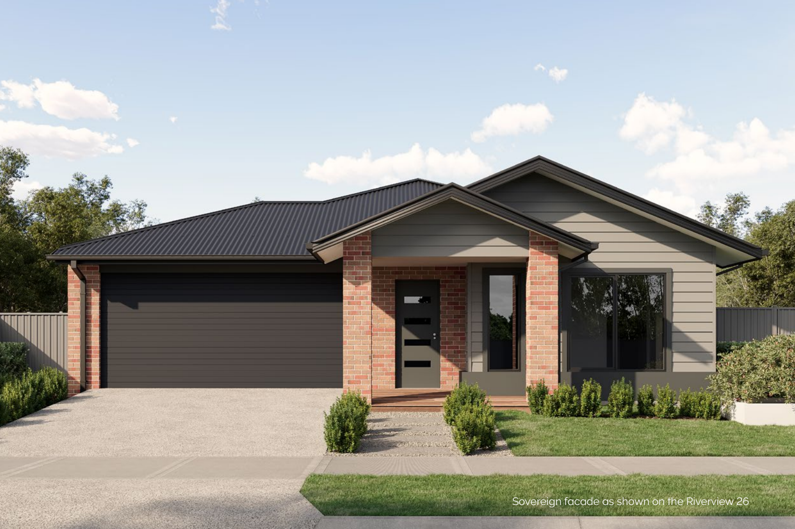
Sovereign facade as shown on the Riverview 26