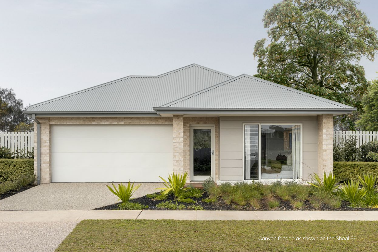
Canyon facade as shown on the Shoal 22