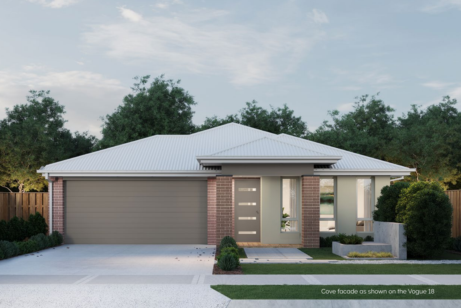
Cove facade as shown on the Vogue 18