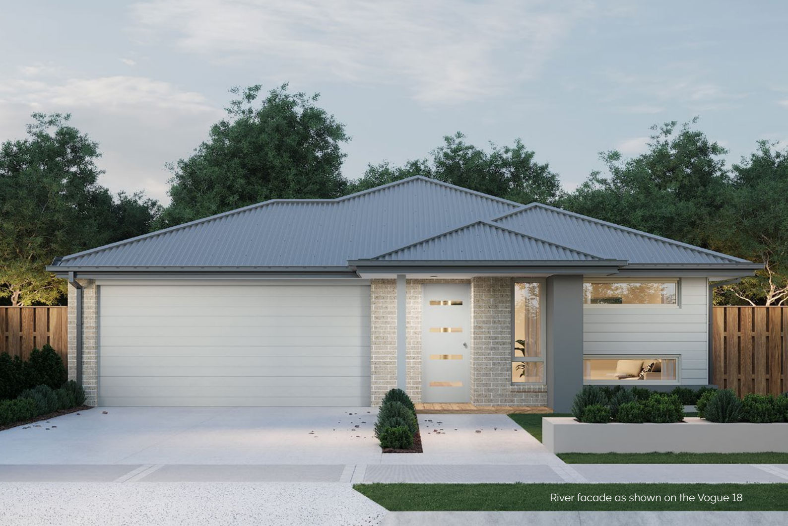
River facade as shown on the Vogue 18