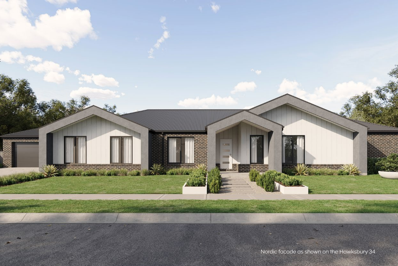
Nordic facade as shown on the Hawksbury 34