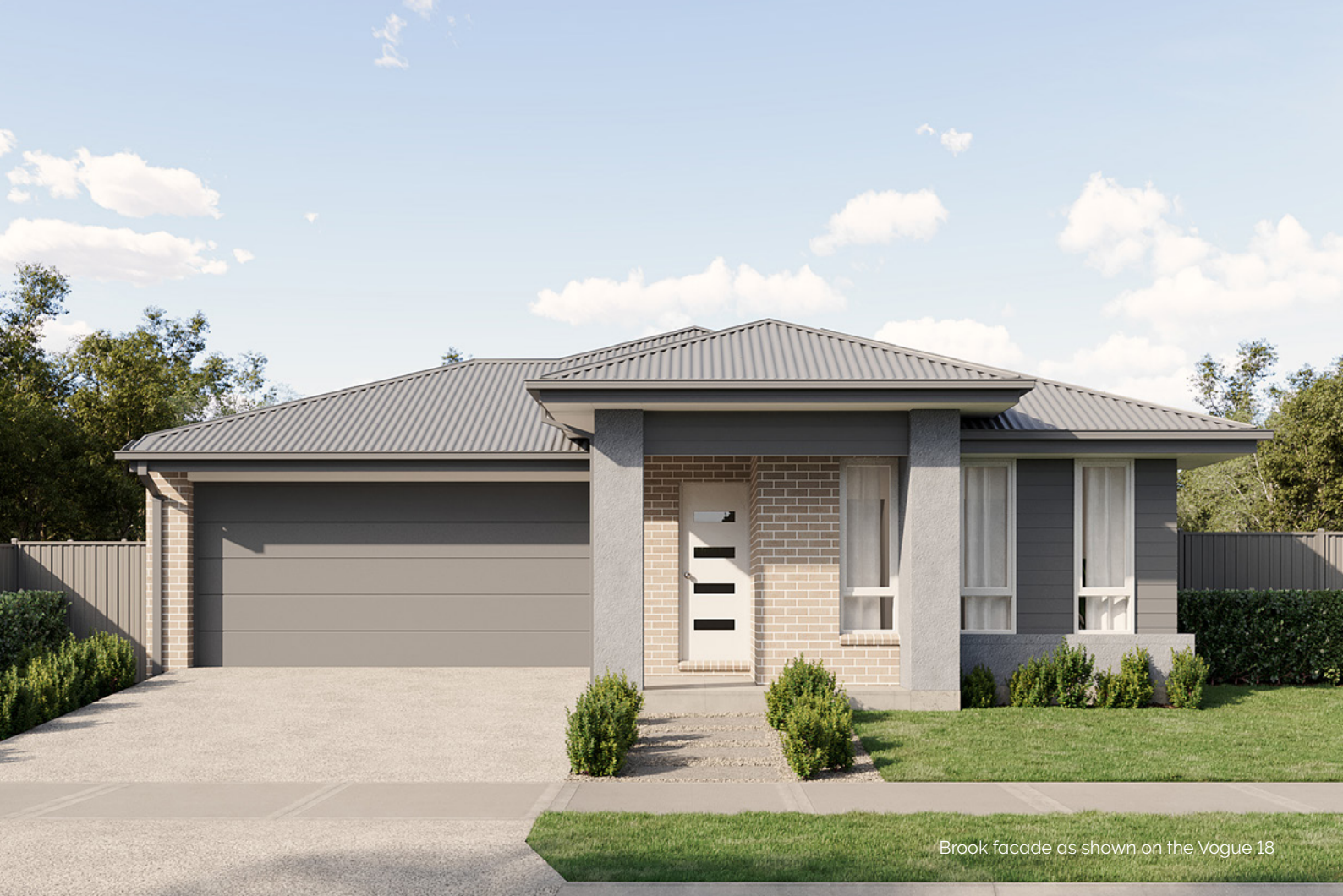
Brook facade as shown on the Vogue 18