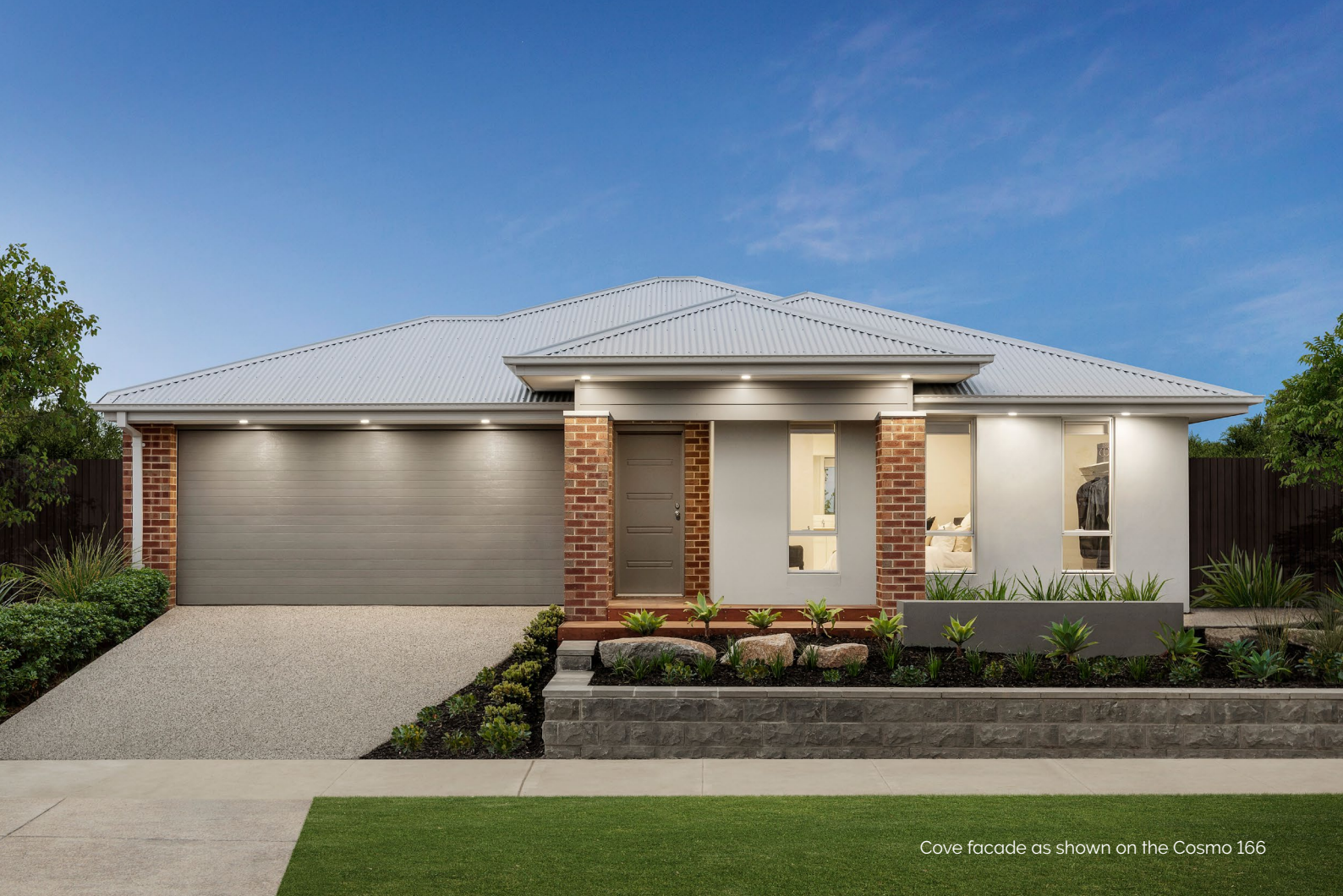
Cove facade as shown on the Cosmo 166