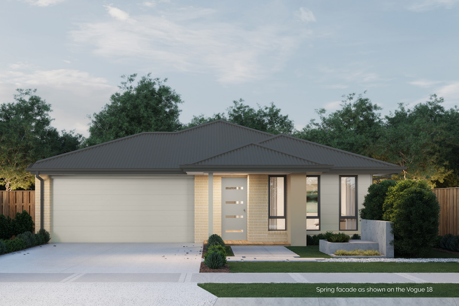
Spring facade as shown on the Vogue 18