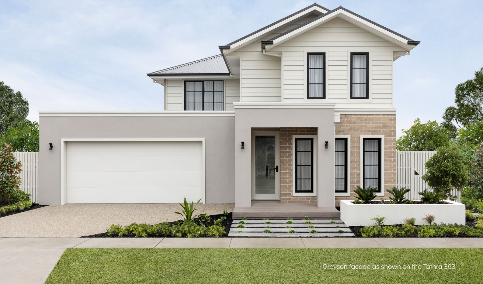
Greyson facade as shown on the Tathra 363