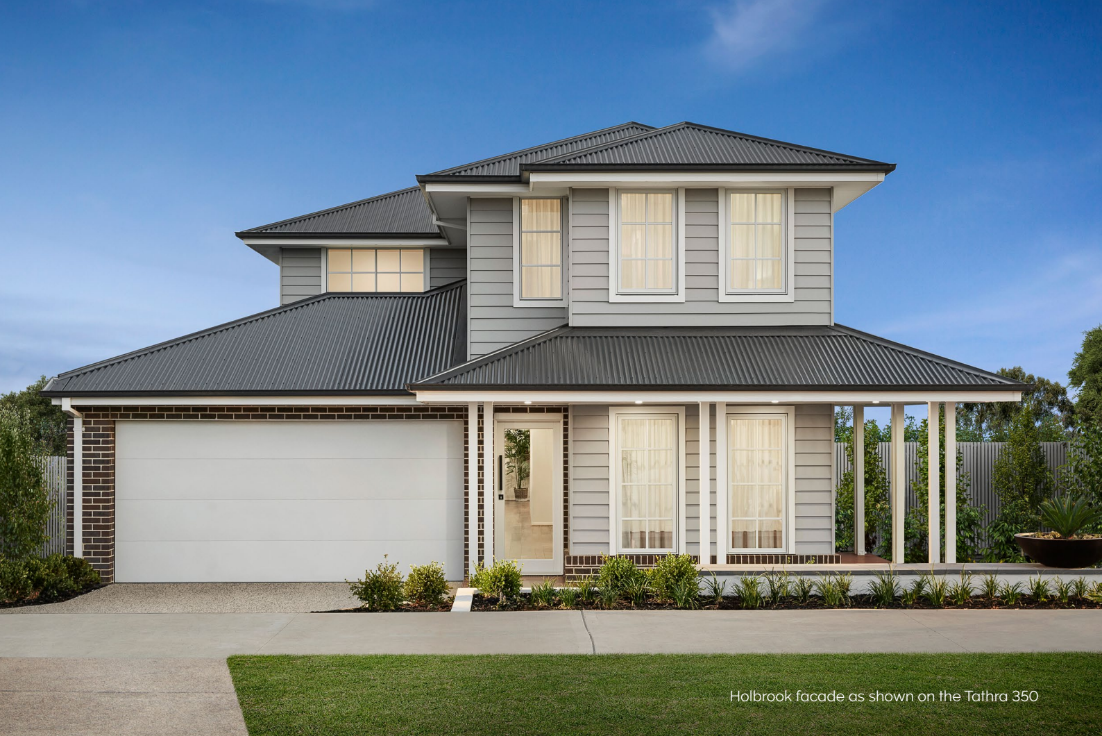
Holbrook facade as shown on the Tathra 350