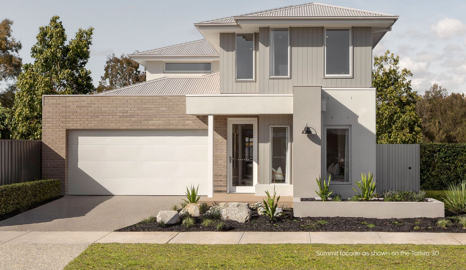
Summit facade as shown on the Tathra 30