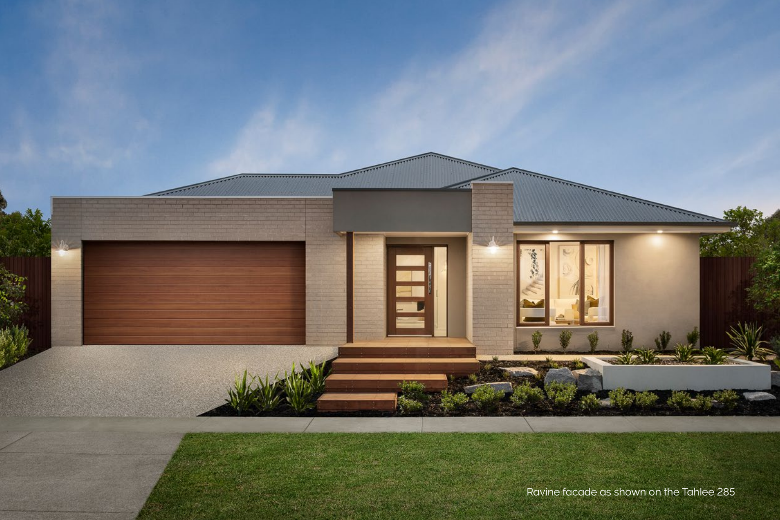
Ravine facade as shown on the Tahlee 285