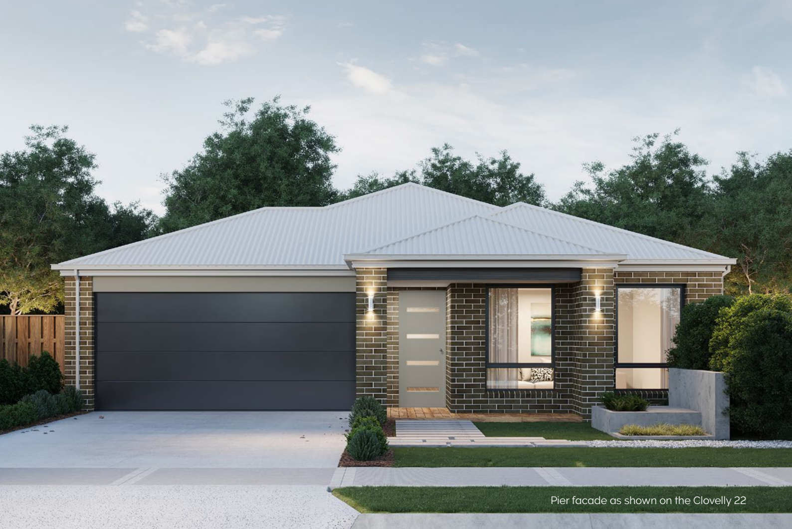
Pier facade as shown on the Clovelly 22