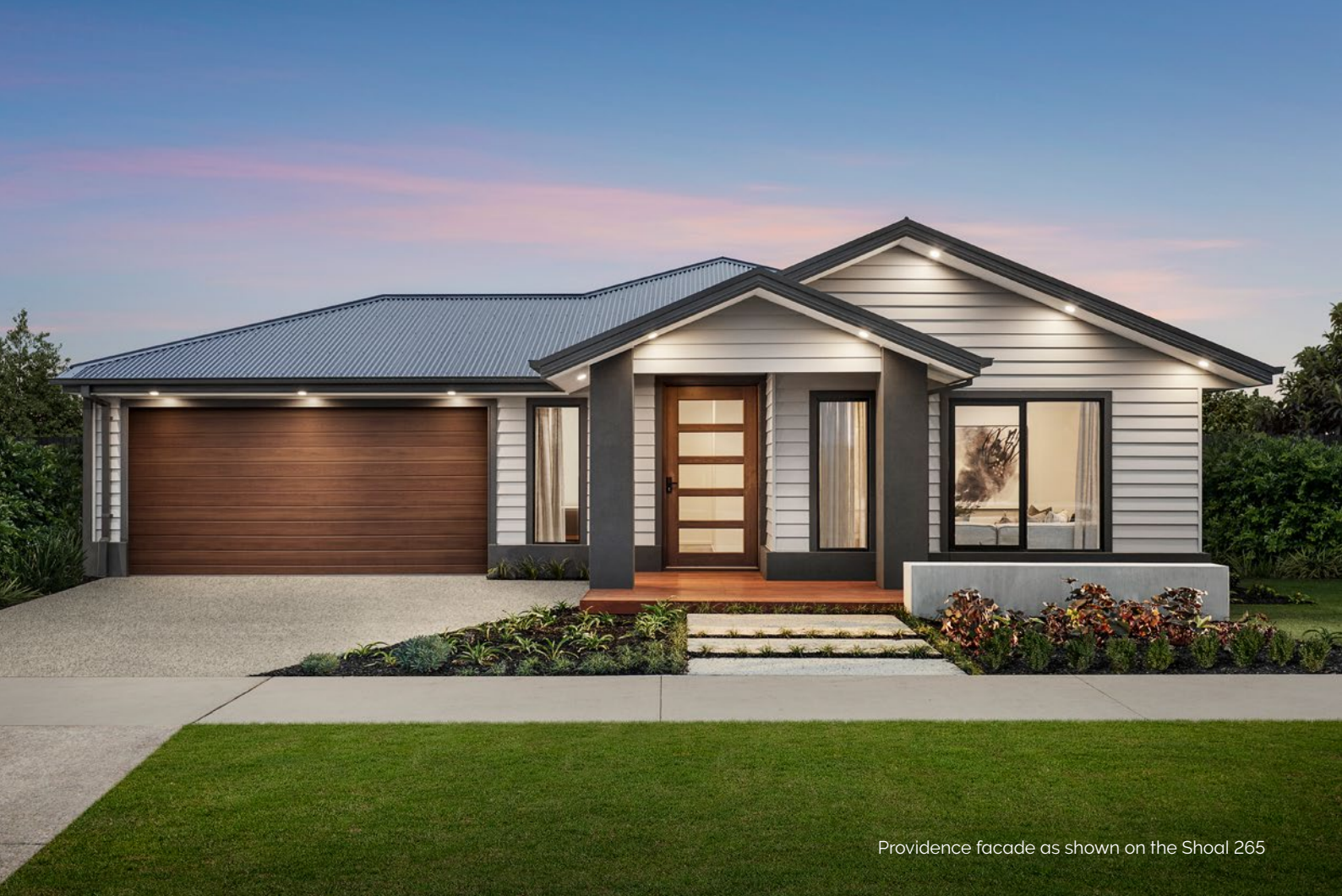
Providence facade as shown on the Shoal 265