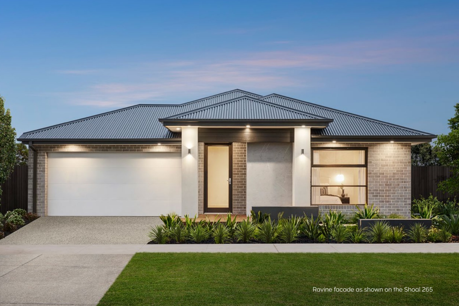
Ravine facade as shown on the Shoal 265