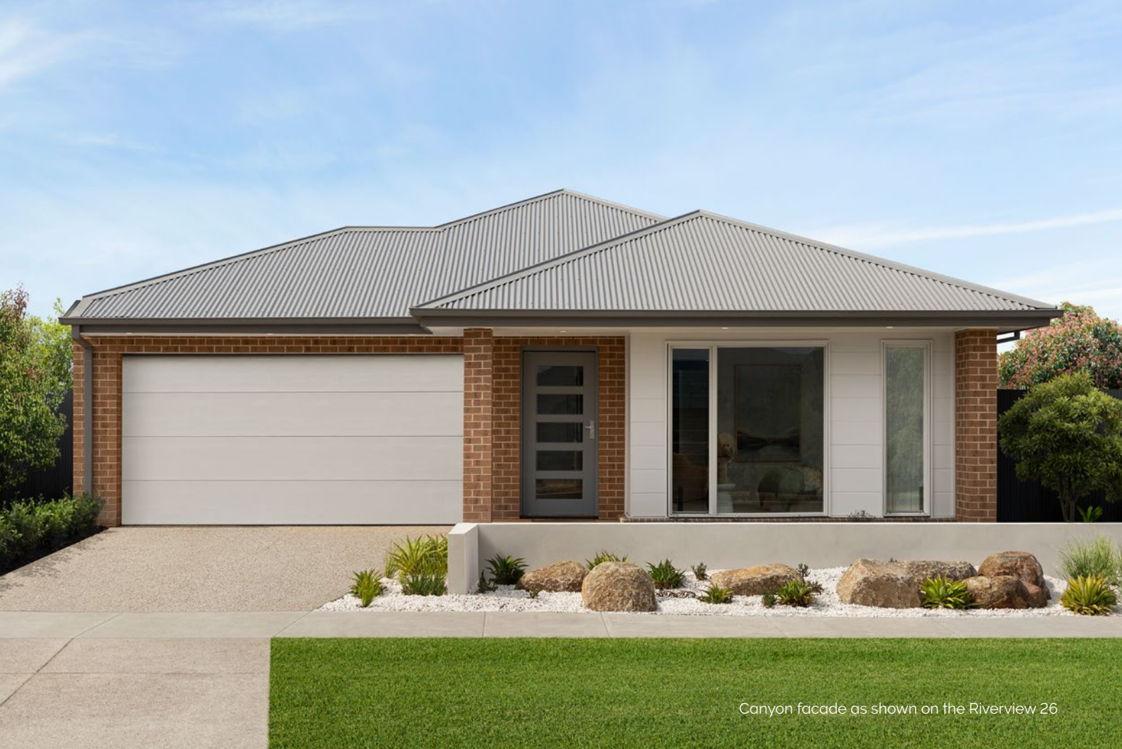
Canyon facade as shown on the Riverview 26