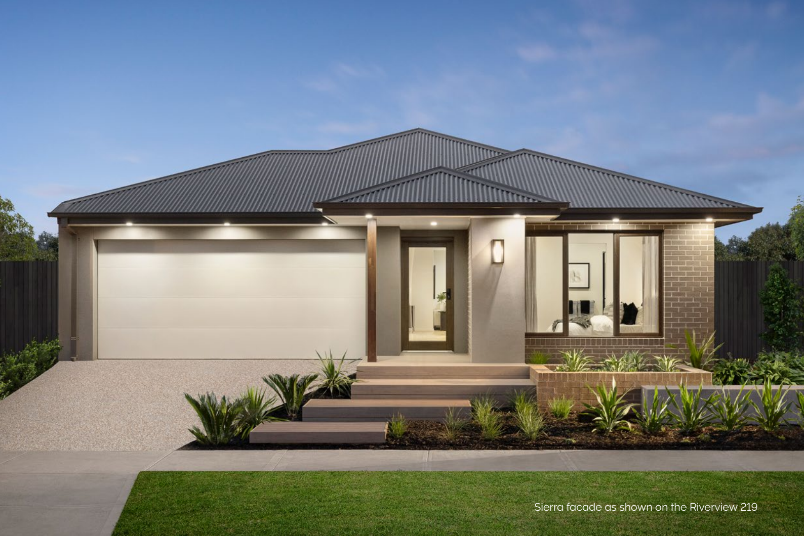
Sierra facade as shown on the Riverview 219