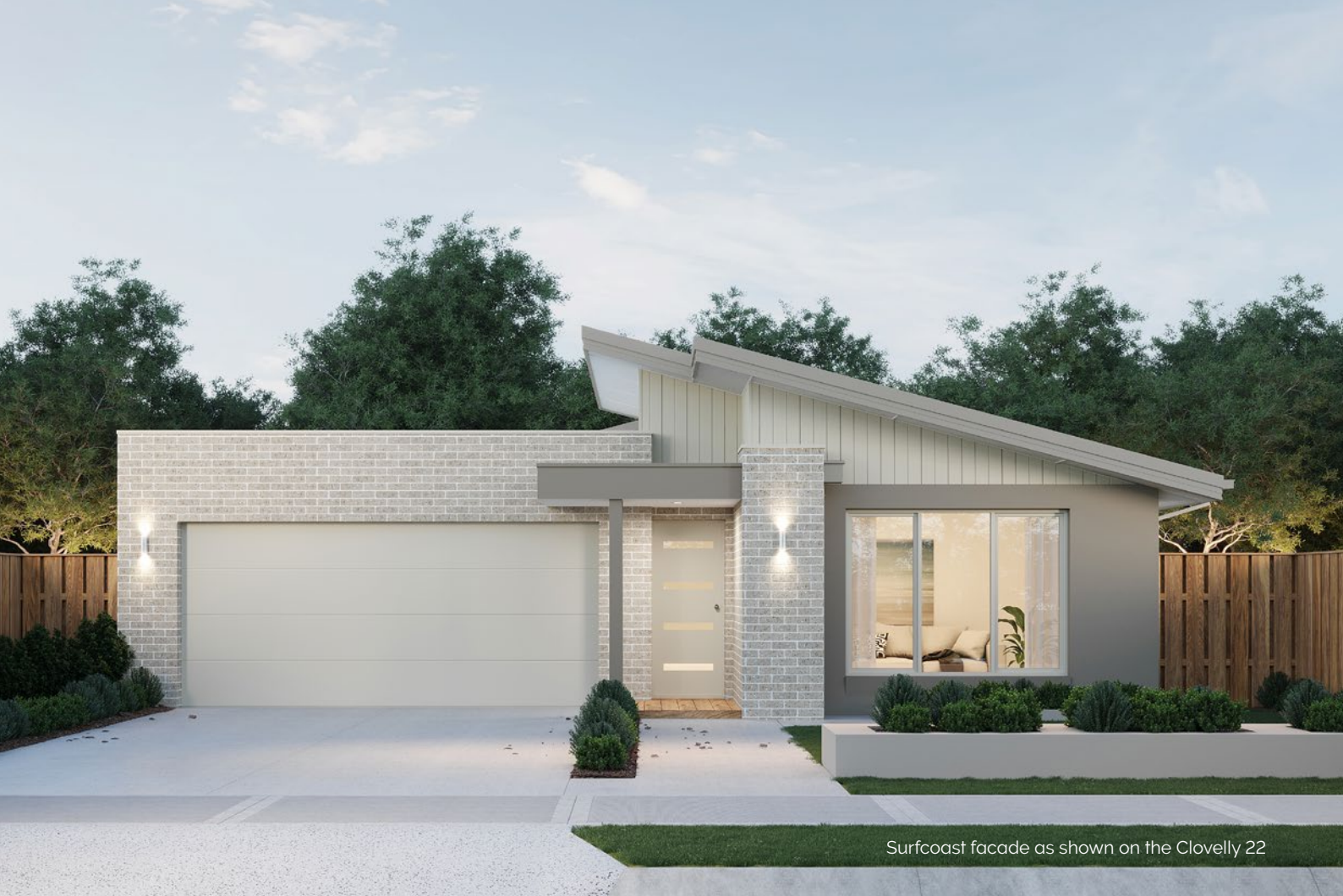
Surfcoast facade as shown on the Clovelly 22