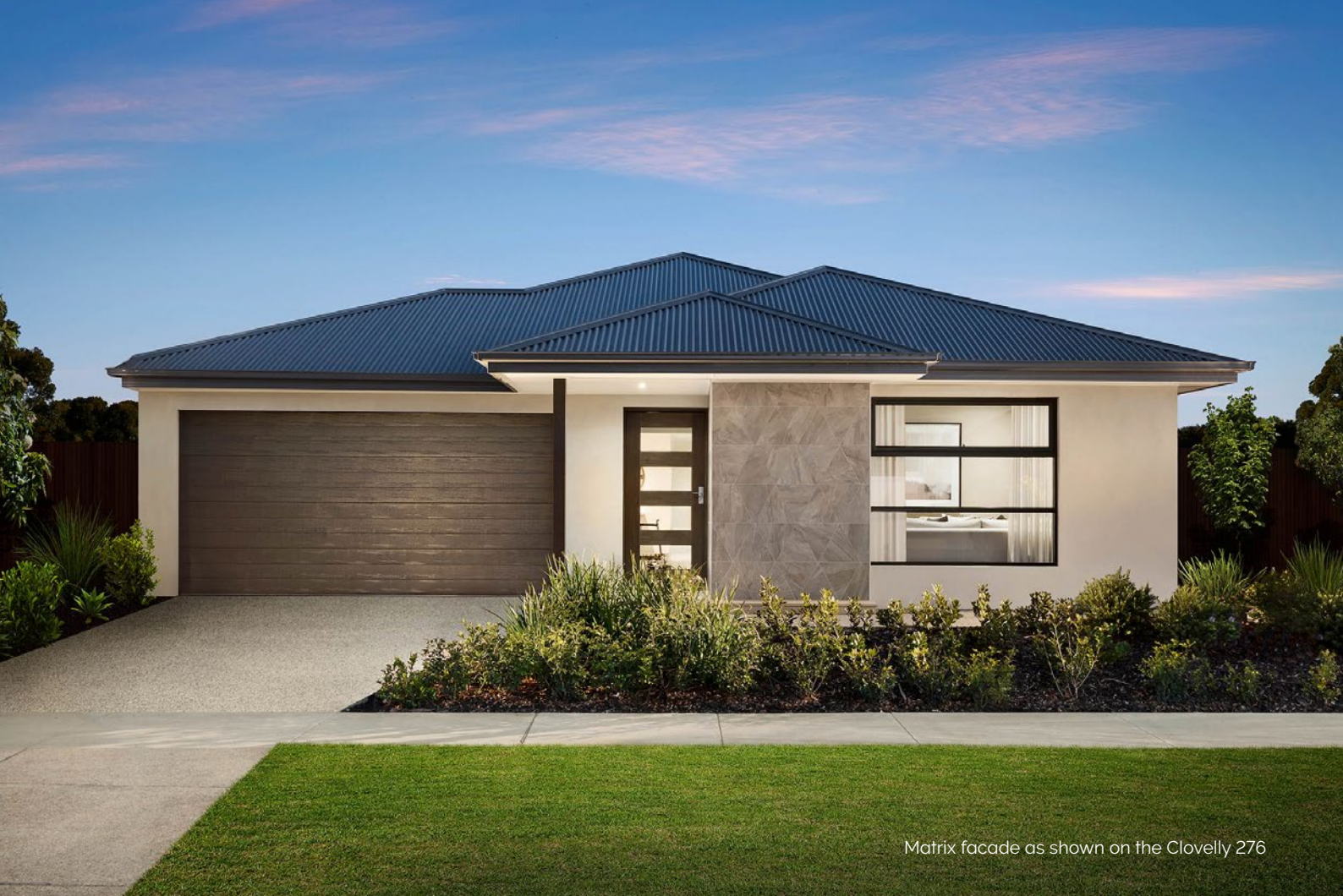
Matrix facade as shown on the Clovelly 276