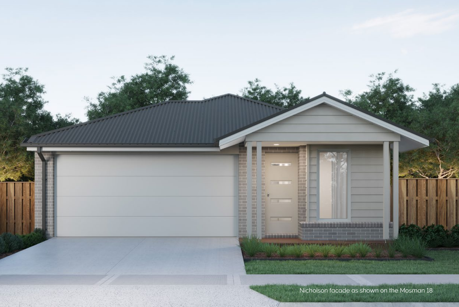
Nicholson facade as shown on the Mosman 18