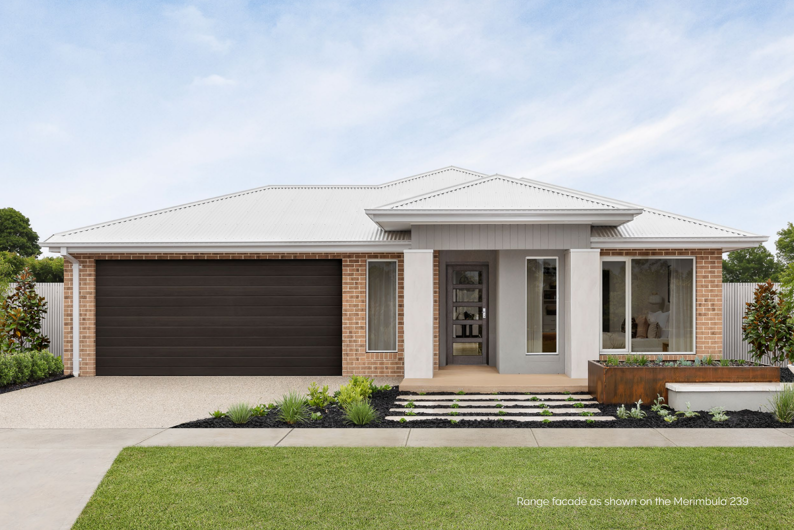
Range facade as shown on the Merimbula 239