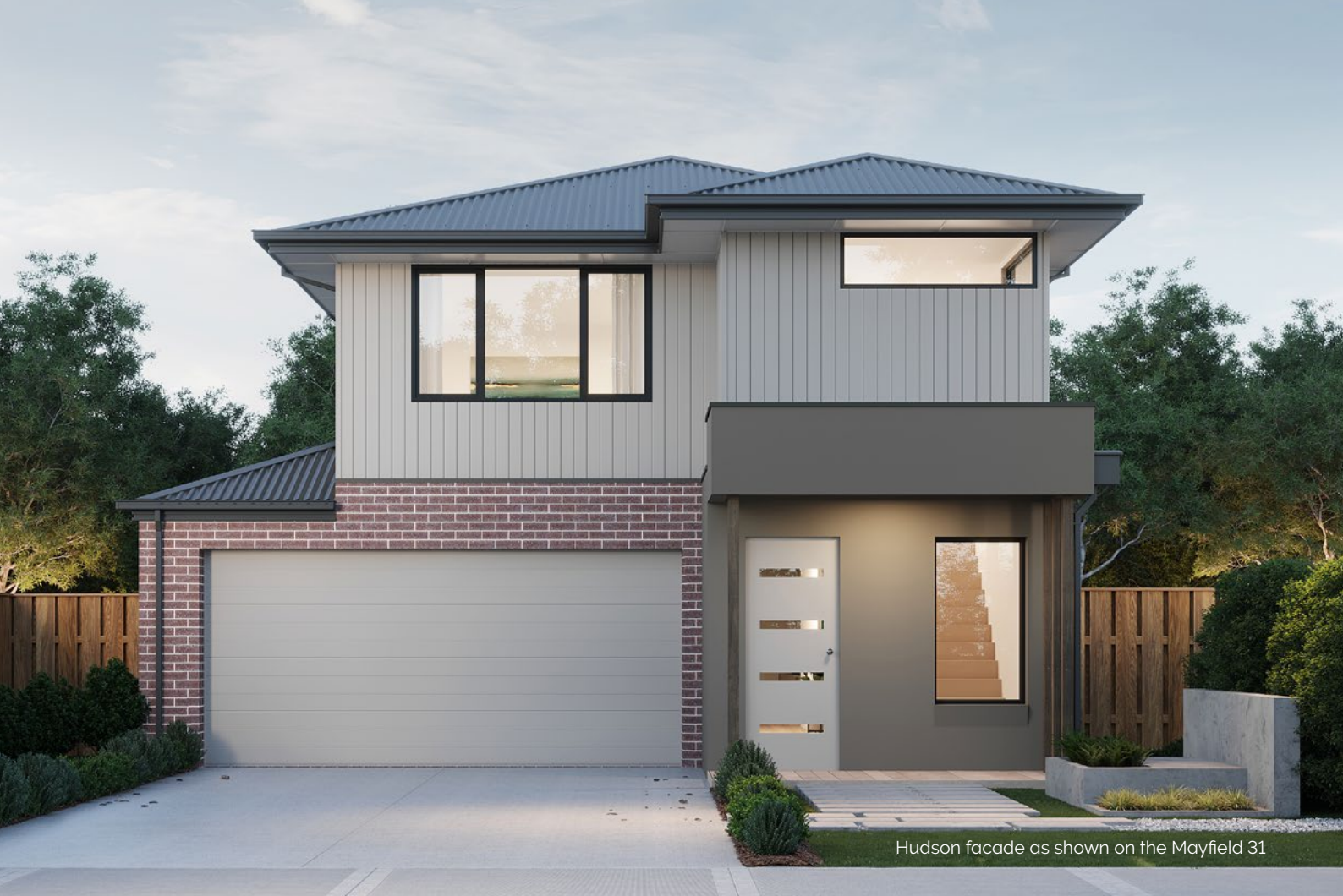
Hudson facade as shown on the Mayfield 31