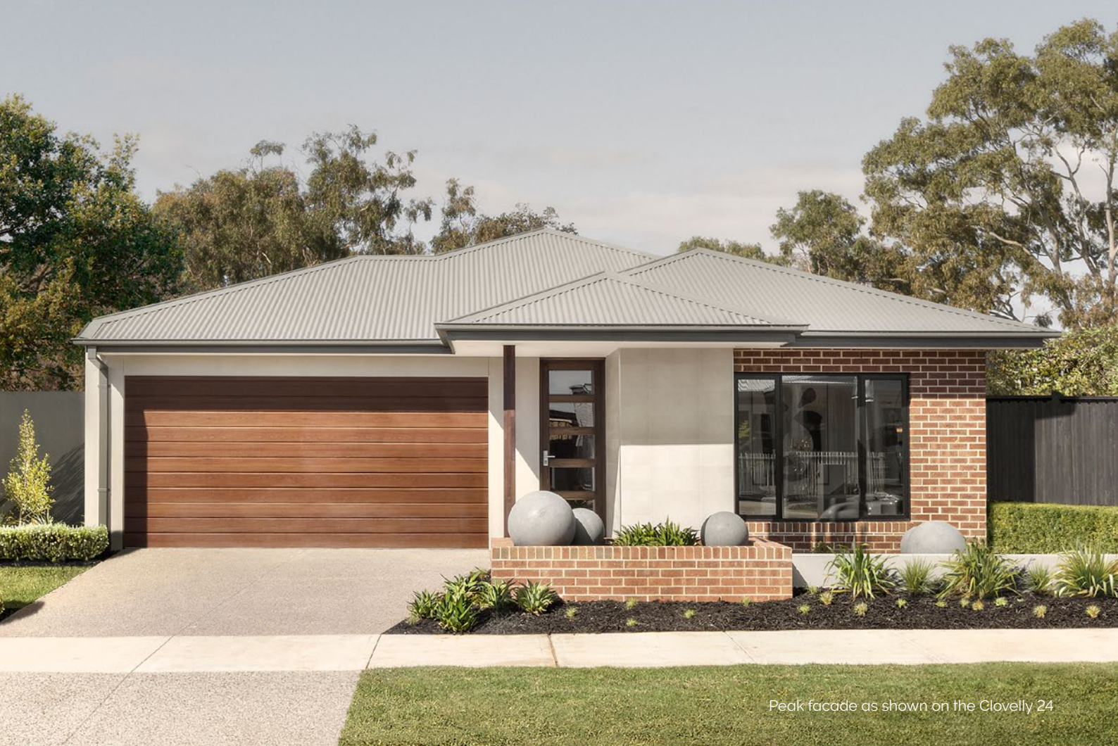
Peak facade as shown on the Clovelly 24