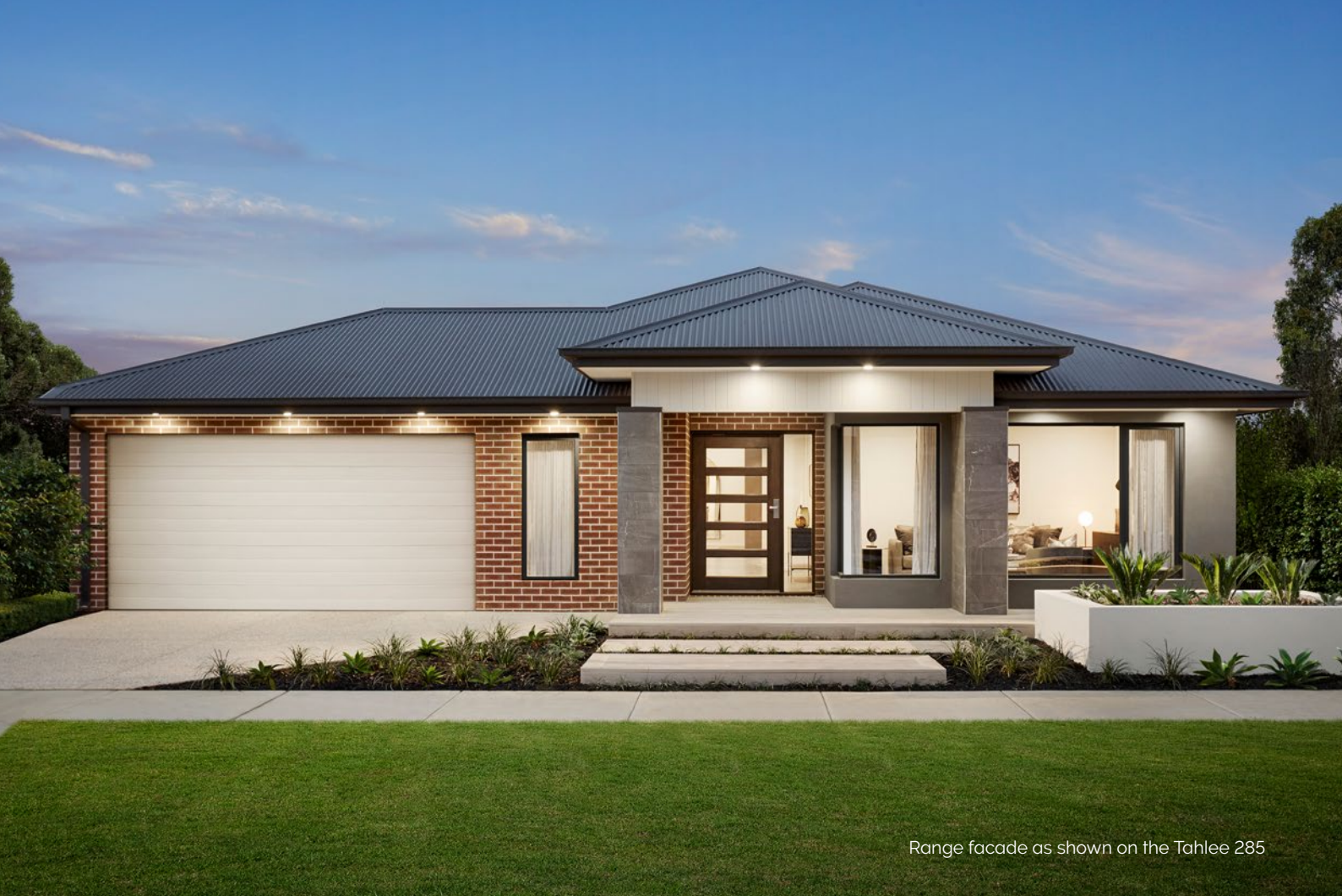
Range facade as shown on the Tahlee 285