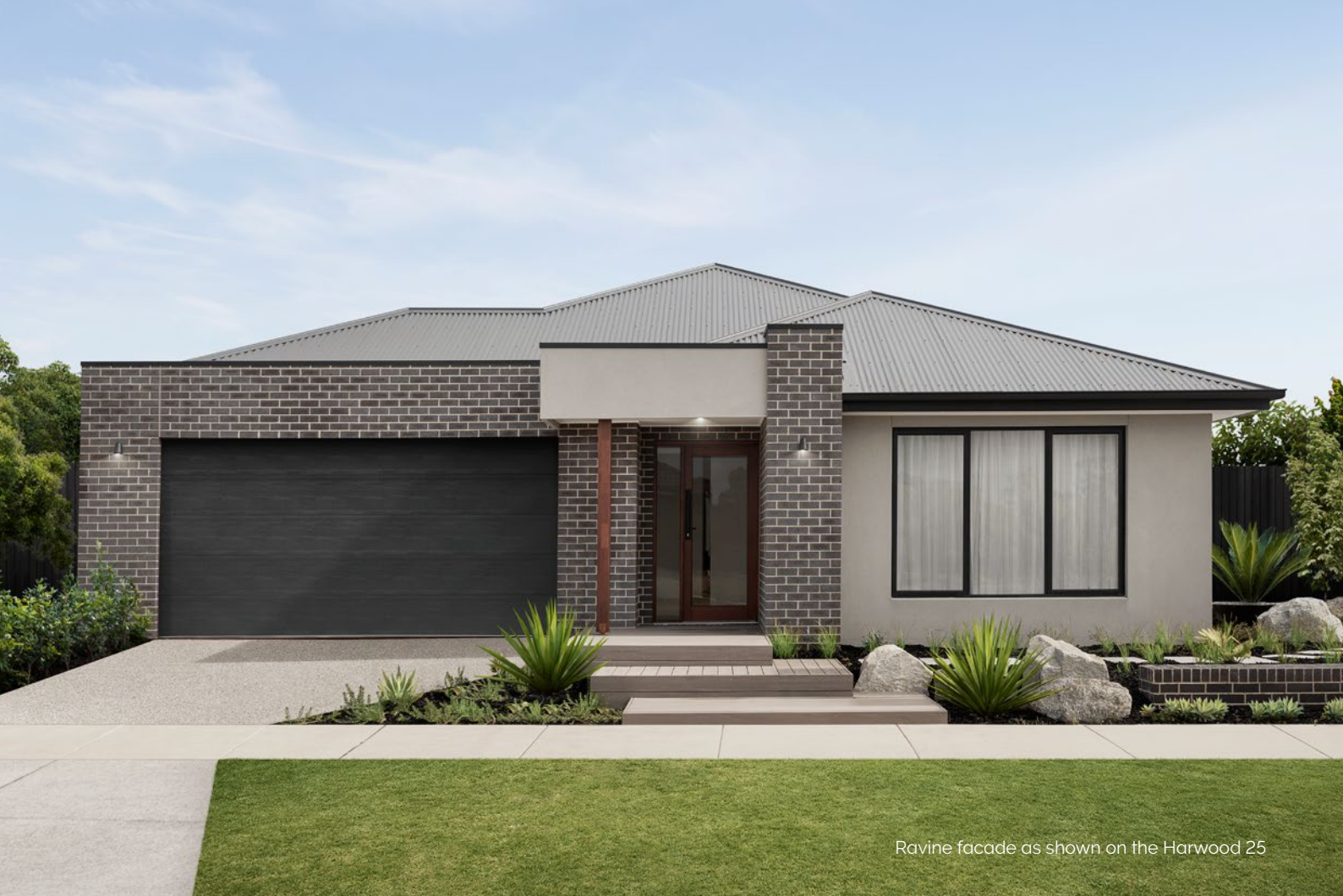
Ravine facade as shown on the Harwood 25