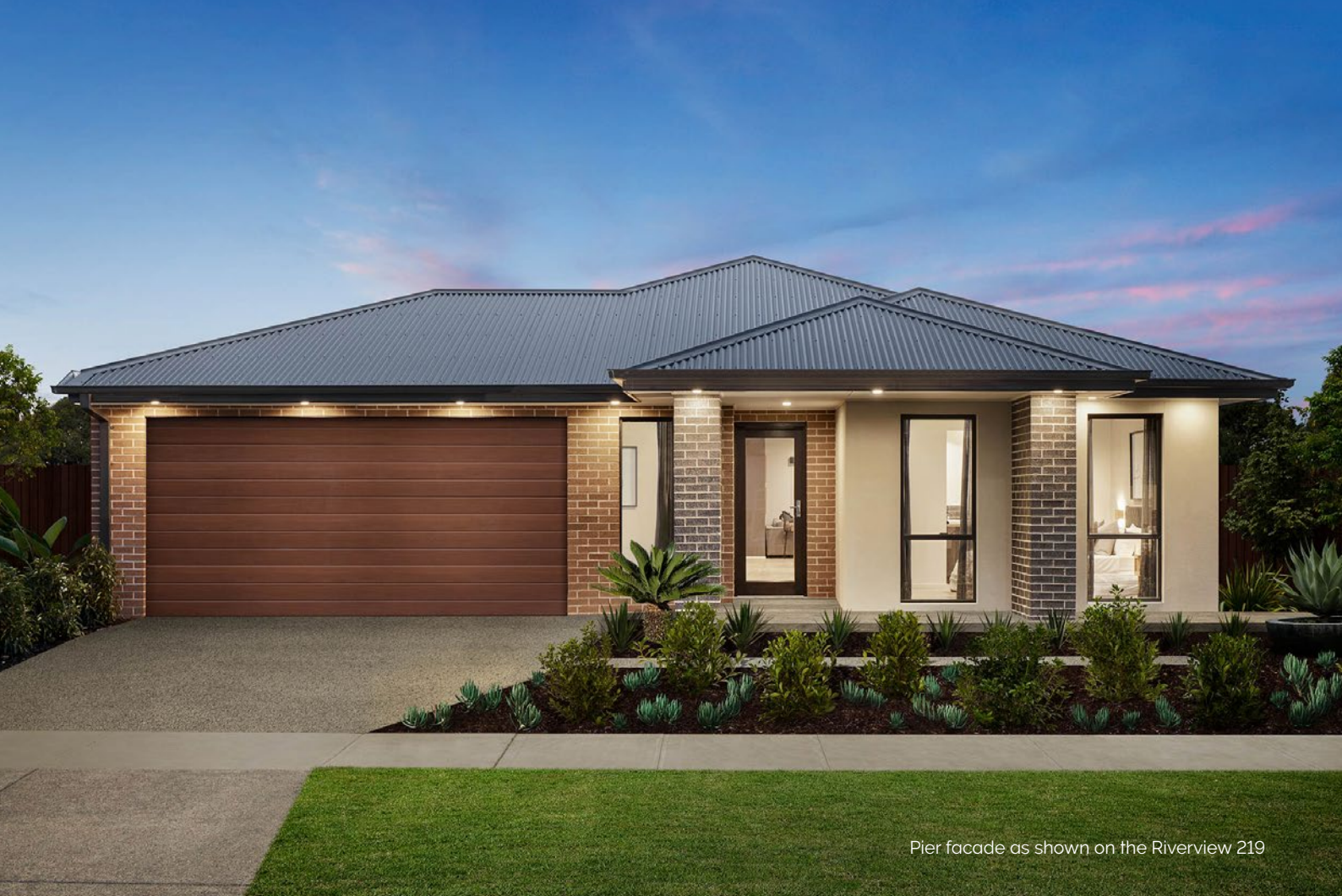
Pier facade as shown on the Riverview 219