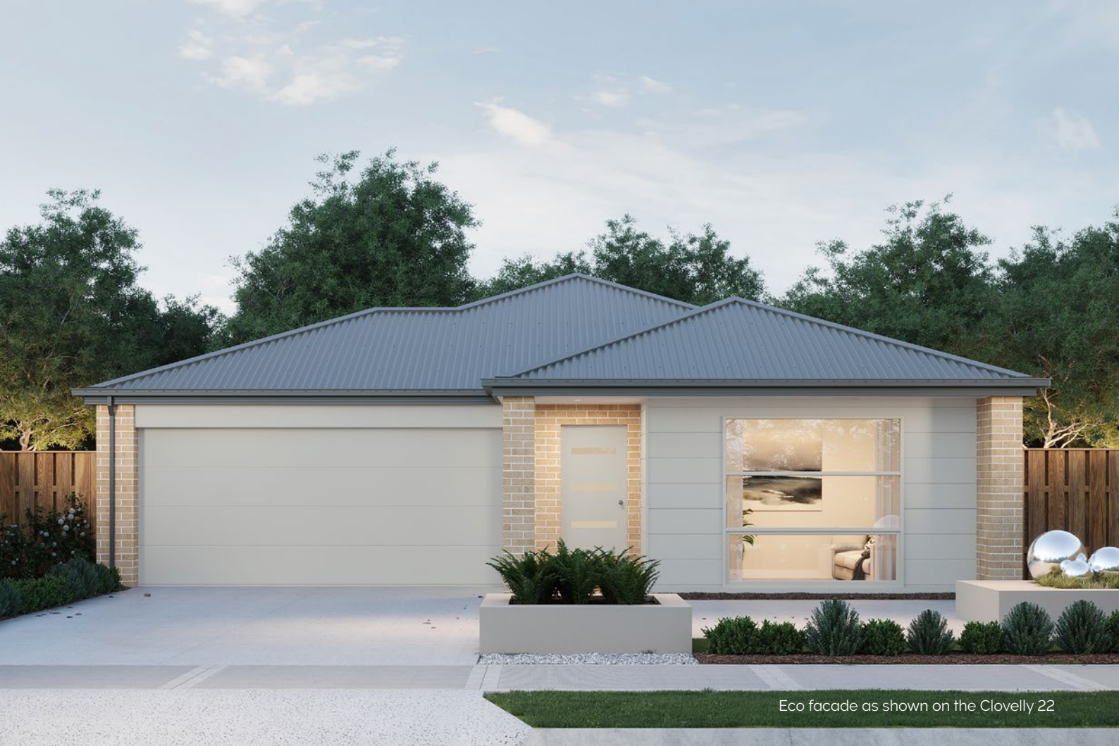
Eco facade as shown on the Clovelly 22