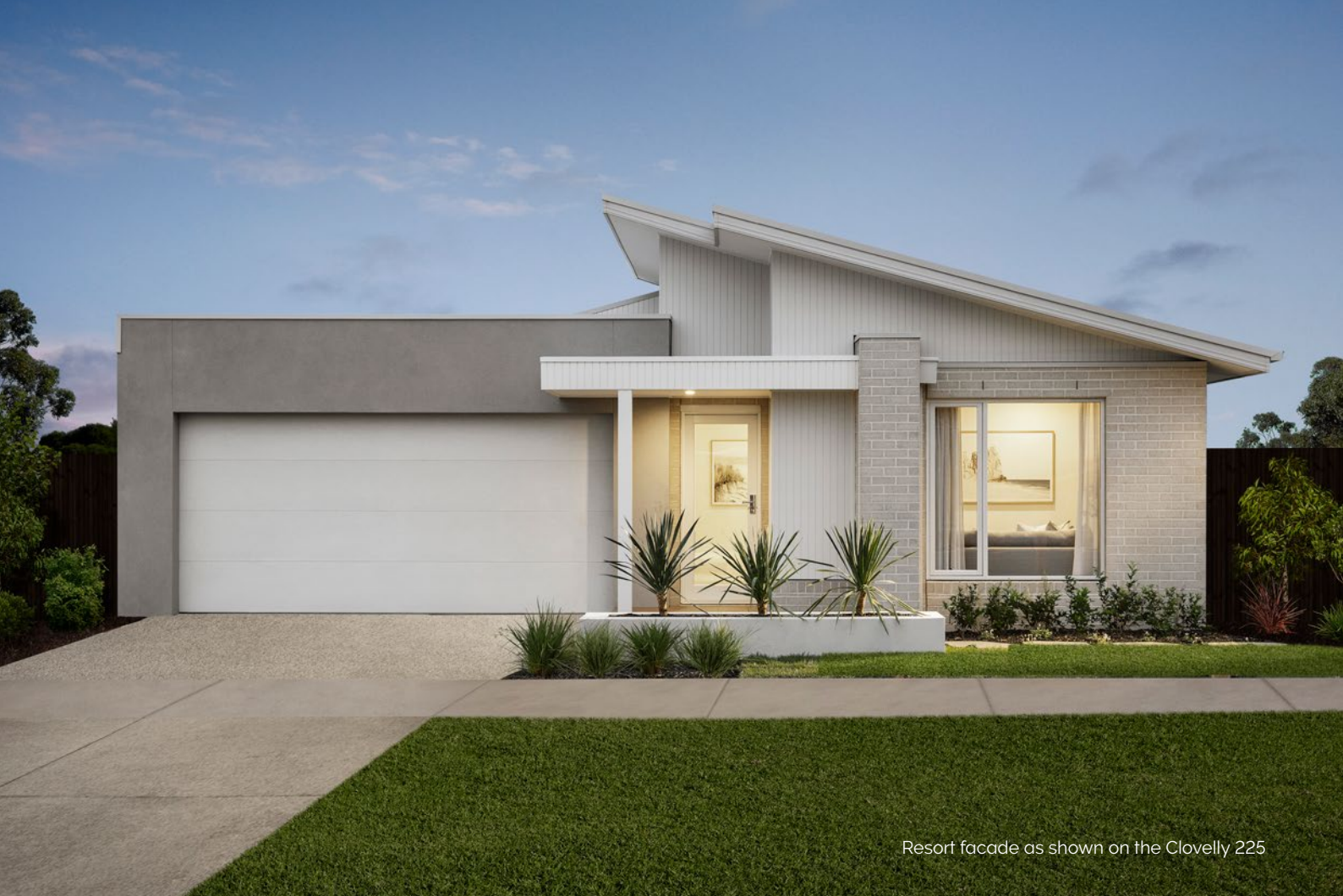
Resort facade as shown on the Clovelly 225