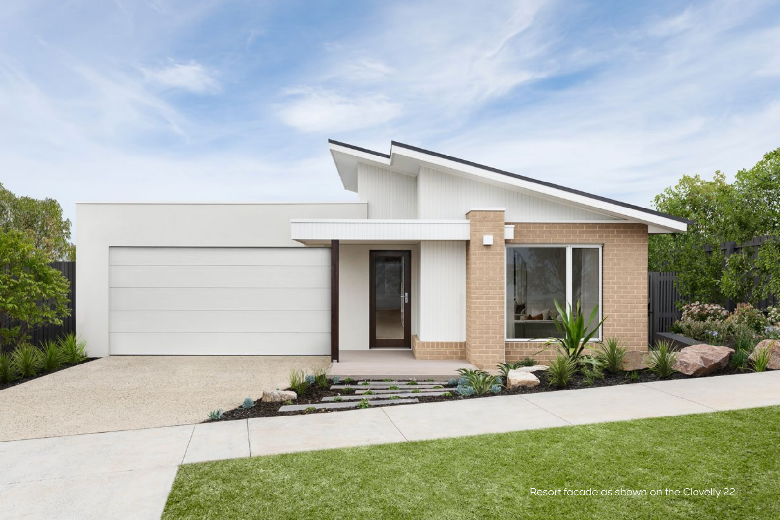
Resort facade as shown on the Clovelly 22