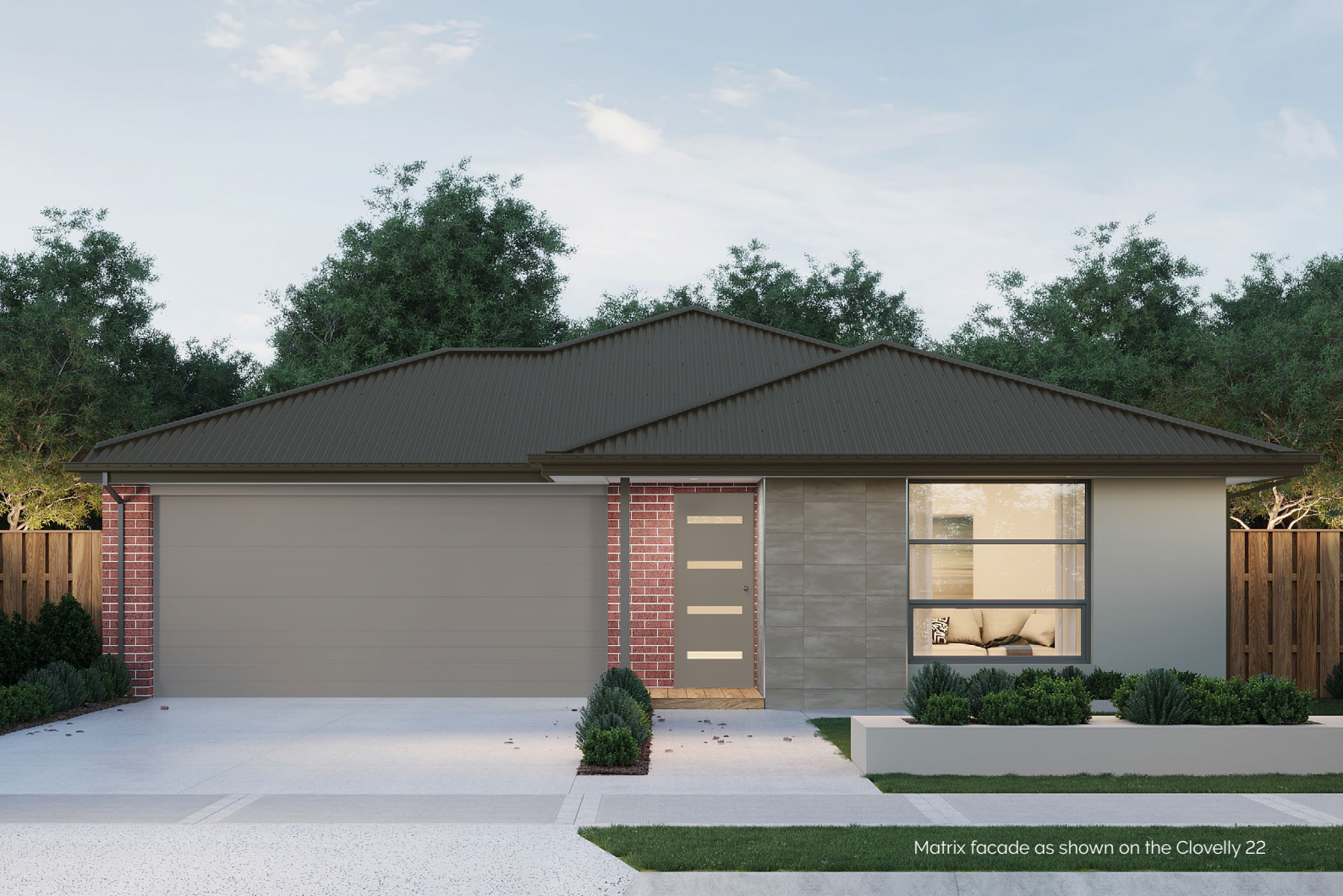
Matrix facade as shown on the Clovelly 22