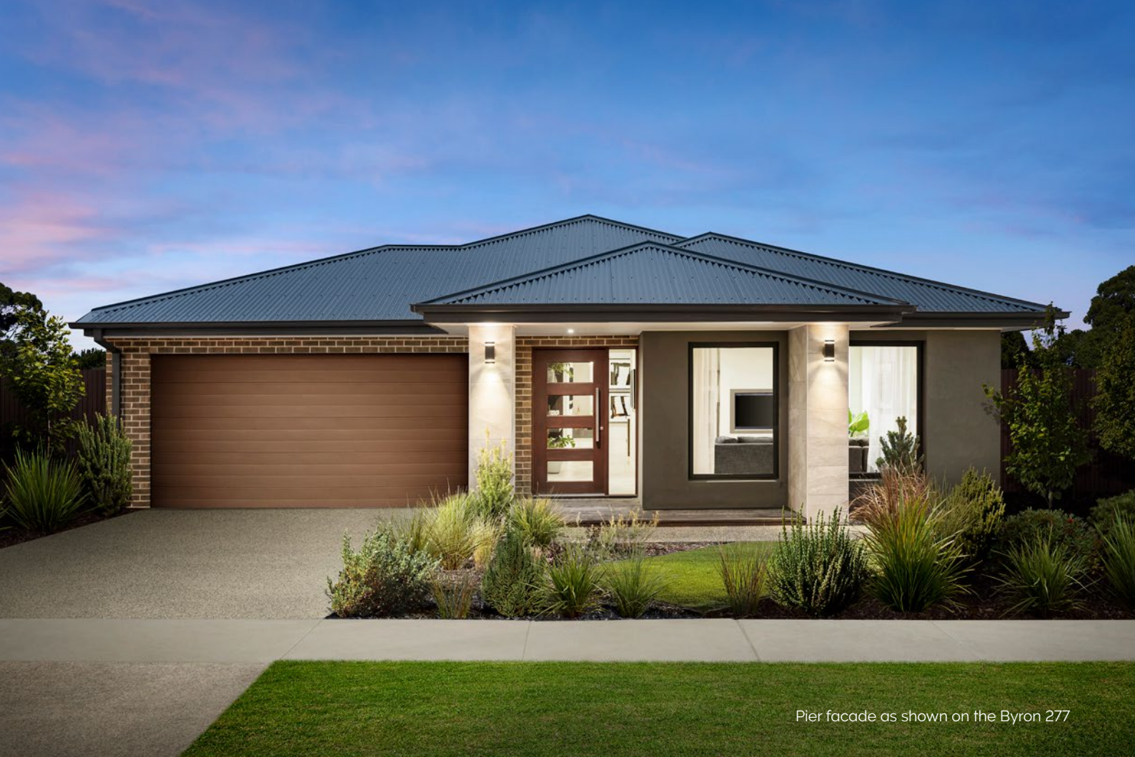
Pier facade as shown on the Byron 277