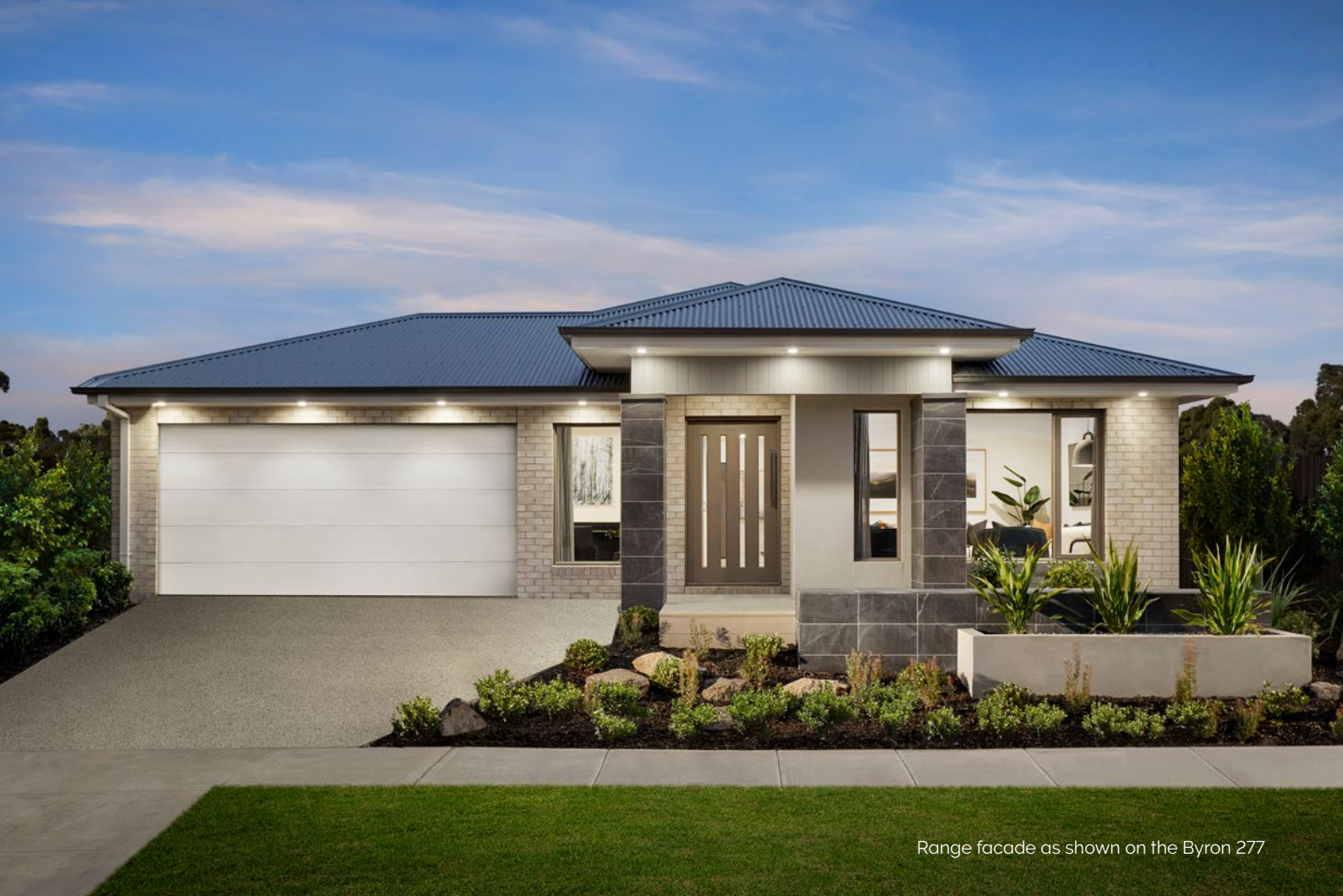
Range facade as shown on the Byron 277