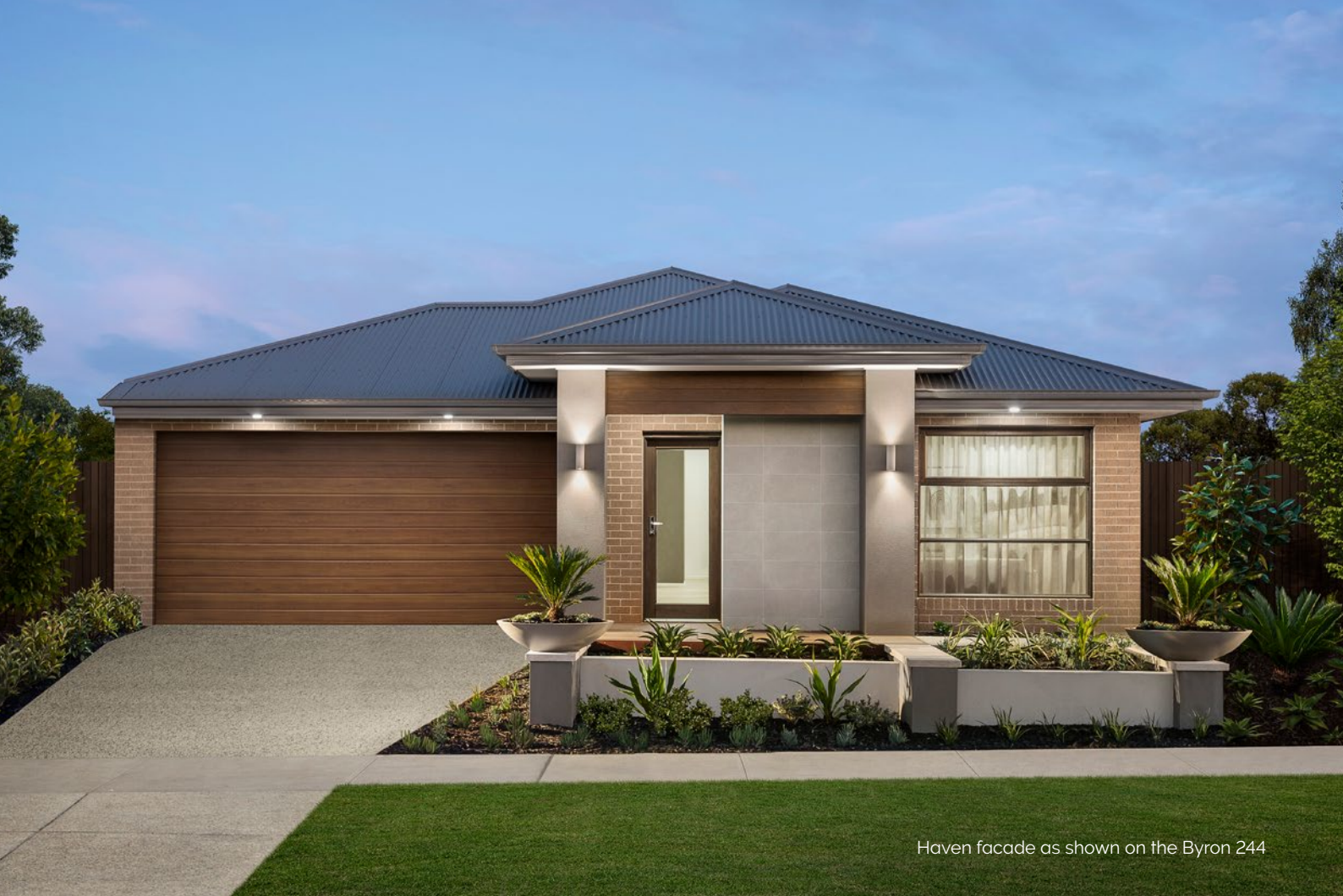
Haven facade as shown on the Byron 244