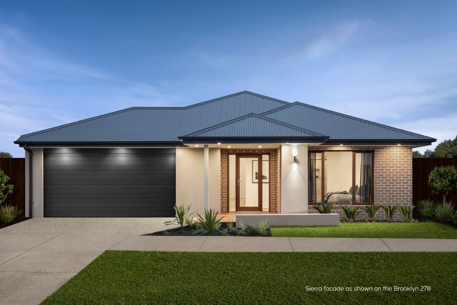
Sierra facade as shown on the Brooklyn 278