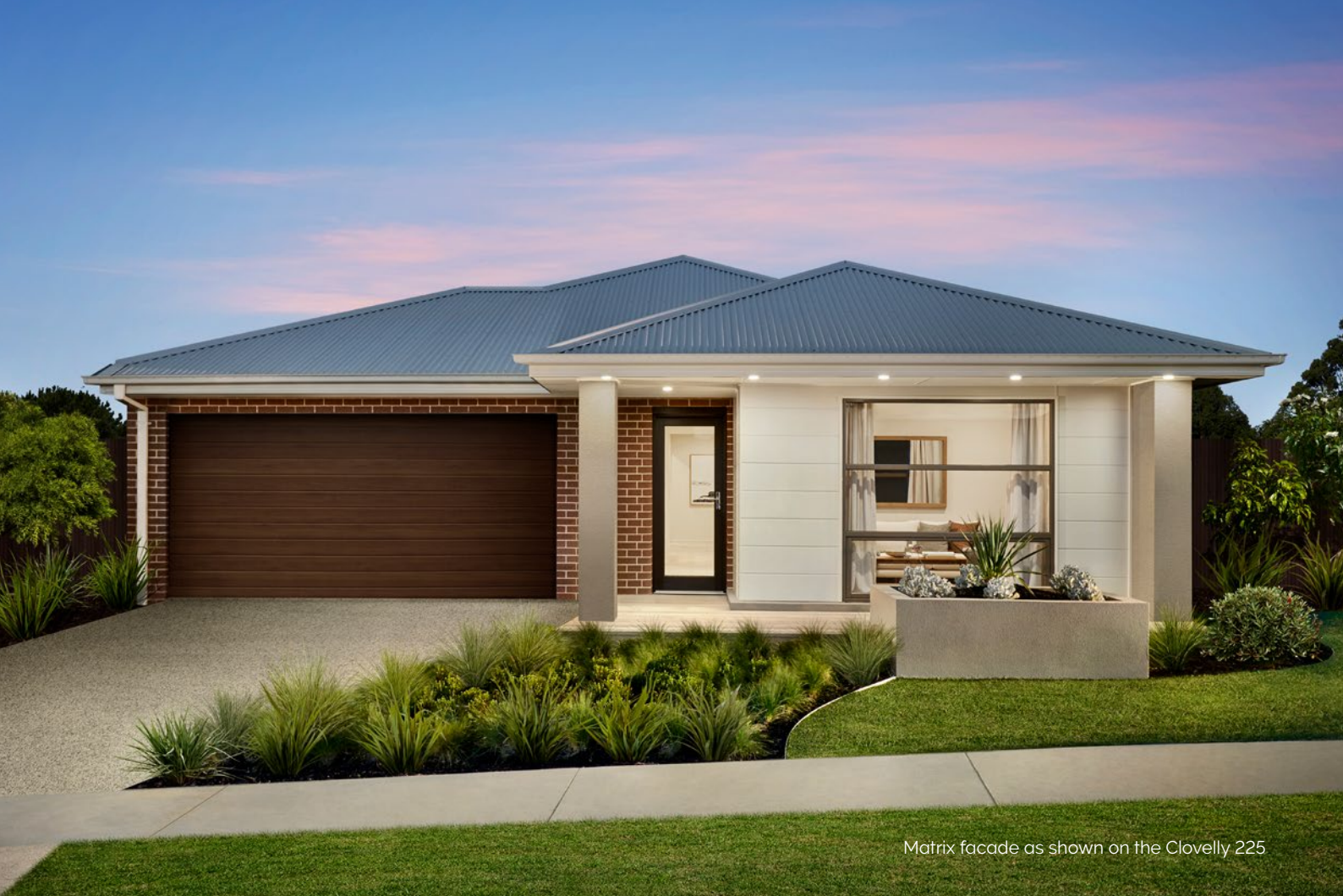
Matrix facade as shown on the Clovelly 225