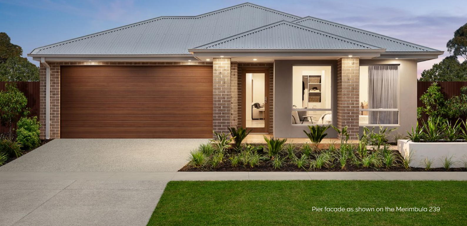
Pier facade as shown on the Merimbula 239