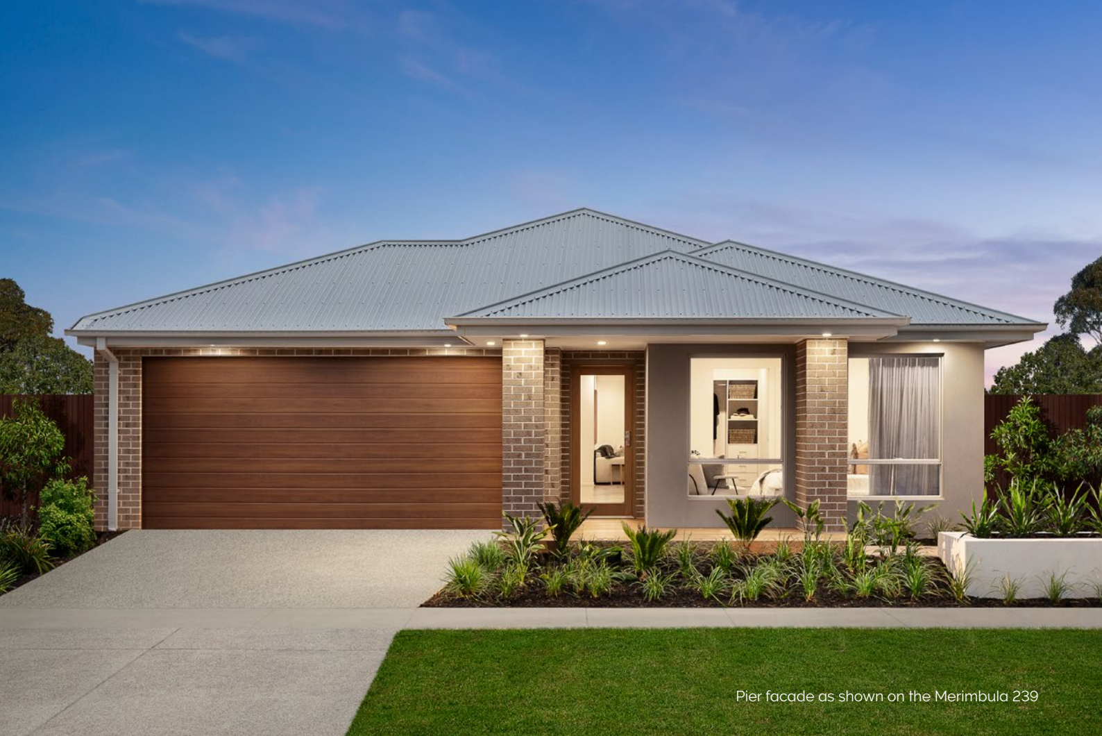
Pier facade as shown on the Merimbula 239