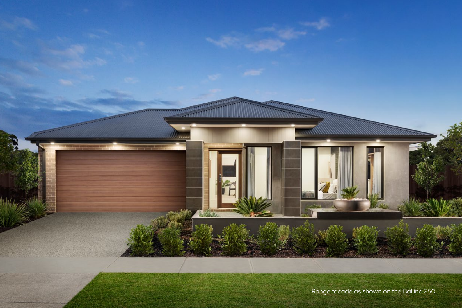
Range facade as shown on the Ballina 250