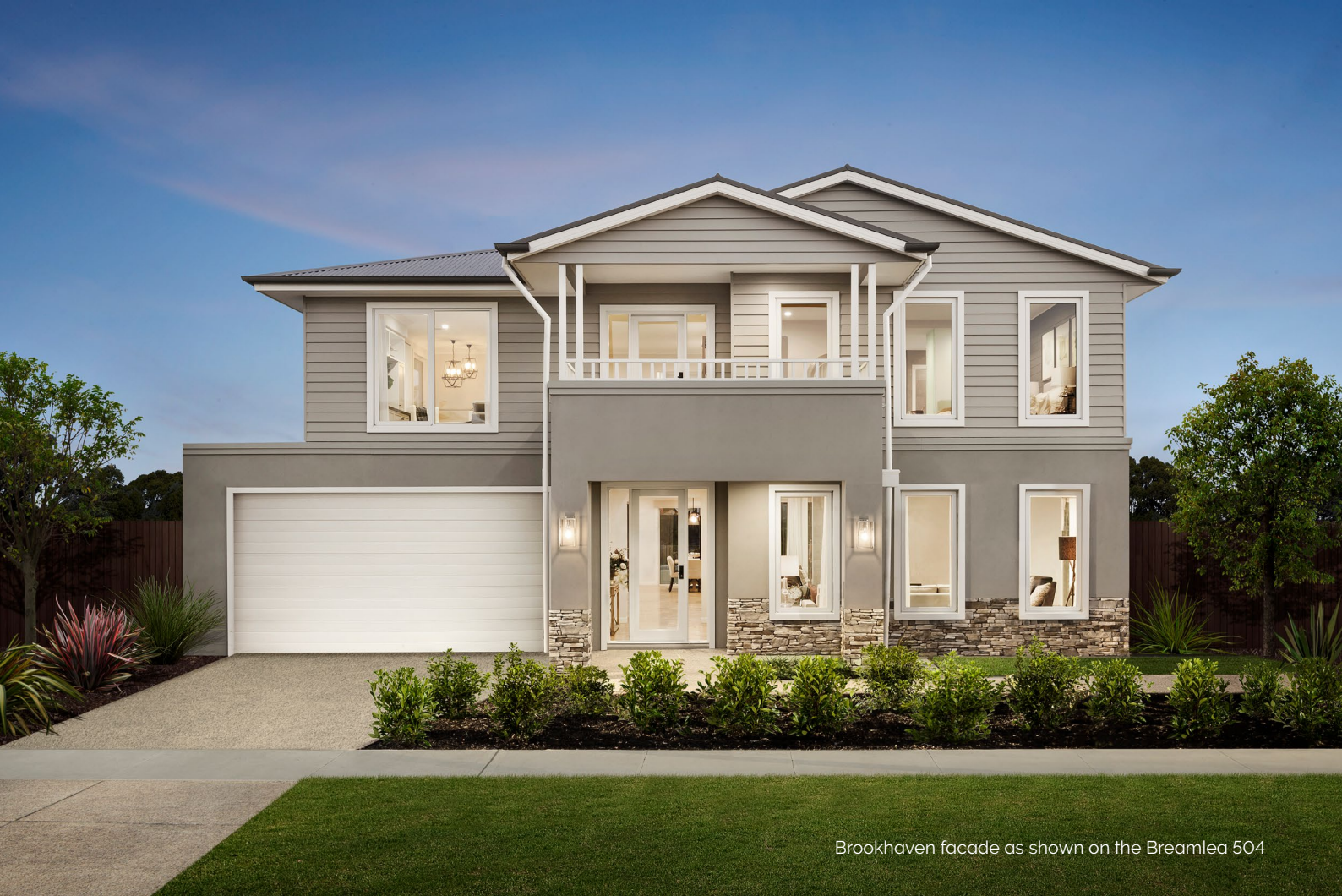
Brookhaven facade as shown on the Breamlea 504